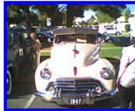
1947 Oldsmobile Series "66"